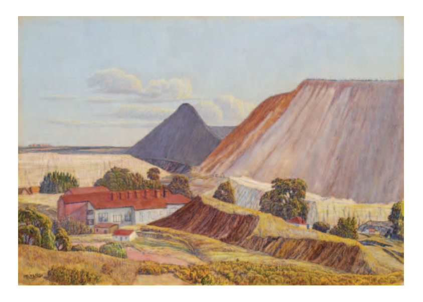
Moses Tladi (South African, 1903-59). No. 1 Crown Mines, ca. 1938. Oil on canvas board, 35 × 50 cm. Private collection. Image from Angela Read Lloyd, The Artist in the Garden: The Quest for Moses Tladi (Noordhoek, South Africa: Print Matters, 2009). Image courtesy of Print Matters (Pty), Ltd. Photograph by Michael Hall. Reproduced with permission of the publisher.

African artists had pursued strategies of "reverse appropriation." Oguibe surely knew Bhabha's work; he quoted an 1839 text that Bhabha had also quoted, referring to certain British colonies' constitutions as "mimic representation." The artists discussed by Oguibe—including the Nigerian academic painter Aina Onabolu and Black South African painters working in Post-Impressionist styles—all figured the "hybrid" formally, in varied engagements with European traditions, and sometimes additionally through subject matter, as in portraits of modern Africans. Looking back, we might argue that reverse appropriation manifested most germanely in African naturalistic landscape painting. Whereas fine-grained illusionistic detail in Orientalist painting had persuasively packaged colonial ideology's distortions as reality, Moses Tladi's No. 1 Crown Mines (ca. 1938) inverts this operation. Now it is the reality of the colonized that convinces, though without alerting the viewer to this fact, given that the painting's style and spatial order do not necessarily communicate "African-ness." What the viewer immediately recognizes is the artist's technical mastery.